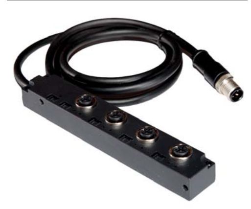
Figure may differ from product